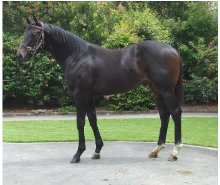
2006 br c Van Nistelrooy—Tennessee West , headed for the Select Sale