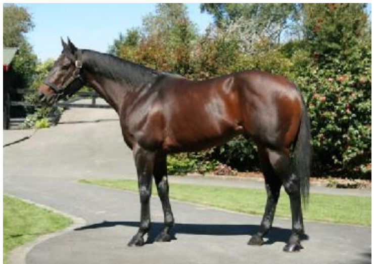
Elusive City (USA) (Elusive Quality)

Elusive City (USA) (Elusive Quality) is also on track to serve a book of over ninety mares in his fourth season at stud.