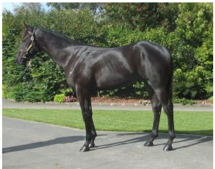
2006 br c Don Eduardo—Ocean Pearl, half brother to Mikki Street headed for the Premier Sale