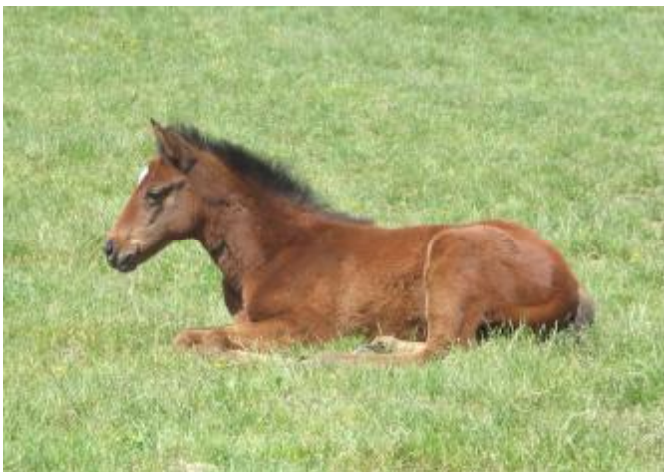
Midnight Breaker's Don Eduardo filly enjoying some afternoon sun—this filly is related to G1 winner Perlin (NZ) (Carnegie)