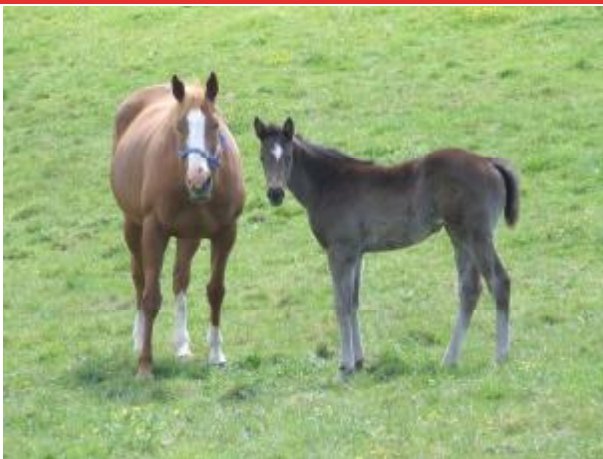
Super Paradise and her Don Eduardo filly