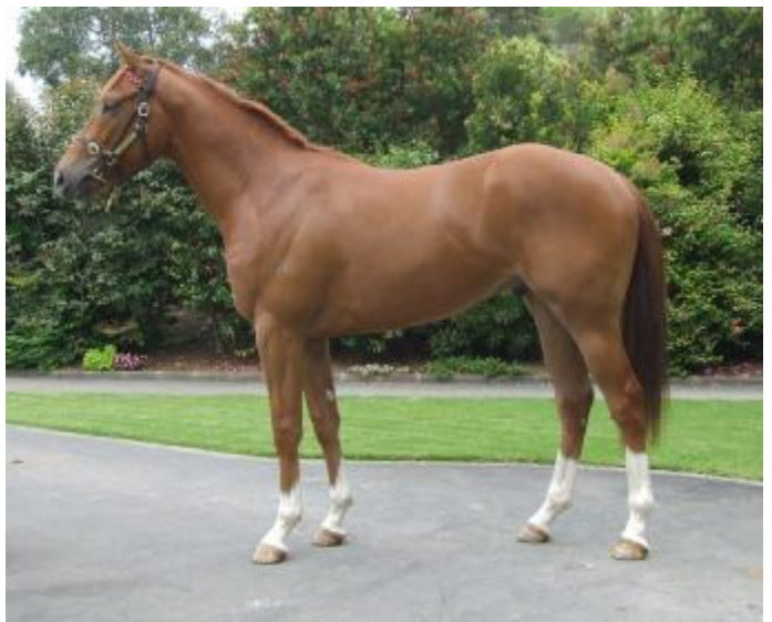
Lot 106—ch g Van Nistelrooy—Filiouchka

The final lot to be offered by Haunui will be Lot 382, a colt by Desert Prince (Ire) (Green Desert), the sire of multiple Group One-winner Desert War (Aus).