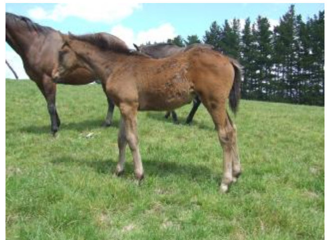
Don Eduardo—Frilly Filly colt