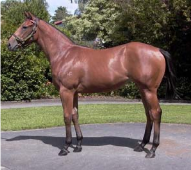
The Redoute's Choice—De Canny filly sold at Karaka 2006 for $320,000